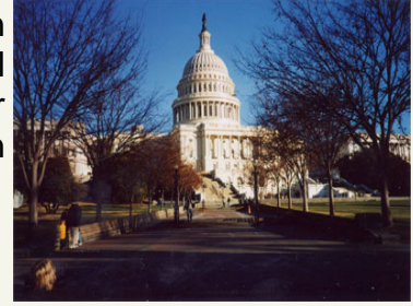
Education on the Hill

The Fur Advisory Council (FAC) has long maintained an active and visible presence in Washington, DC, both on Capitol Hill and with the Administration. It provides a critical voice for the Louisiana fur industry and is a “go-to” source of information for Washington policymakers.