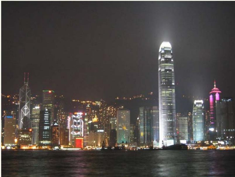
Hong Kong: 'Asia's World City'