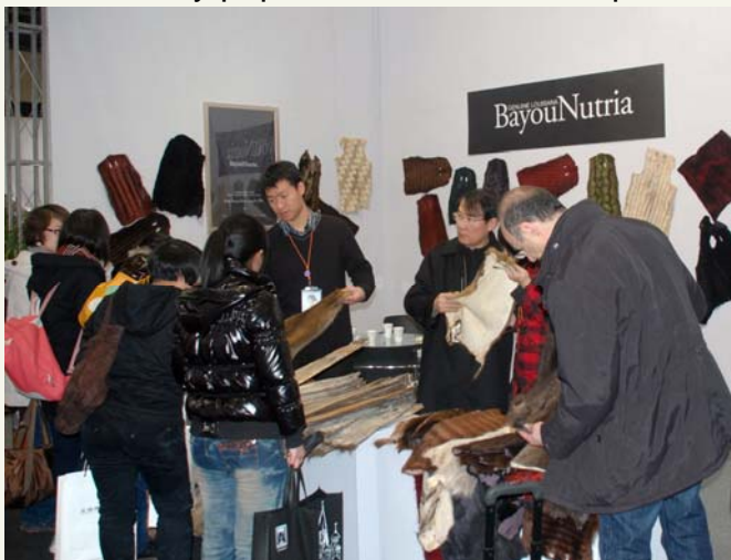
Fur Advisory Council Booth at the Beijing Fur Show, January 2011.

The international designers are taking furs beyond the fur coat or fur jacket. Handbags made in all kinds of furs are selling in Japan and are starting to be seen in North America. Fur trim on fabric garments is still very strong. Ranch furs are doing well, but long hair wild furs are very popular in the skiwear / sportswear market.